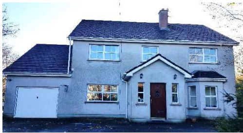
Corrandulla, County Galway