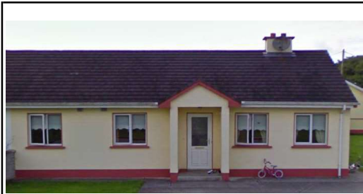
Lawrencetown, County Galway